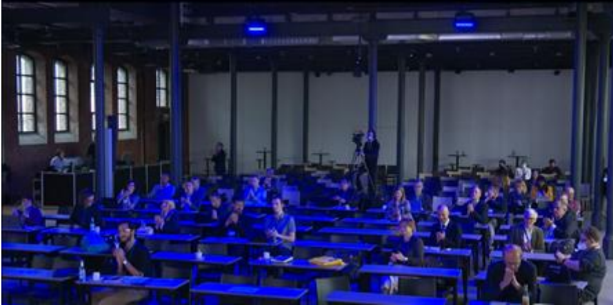
Participants taking part physically in HARMONY second cross-metropolitan workshop in Aachen, Germany