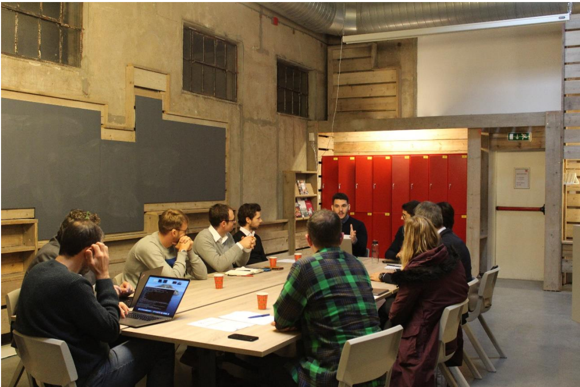
Round table at Harmony first cross-metropolitan workshop, 07/11/2019, Rotterdam, the Netherlands.