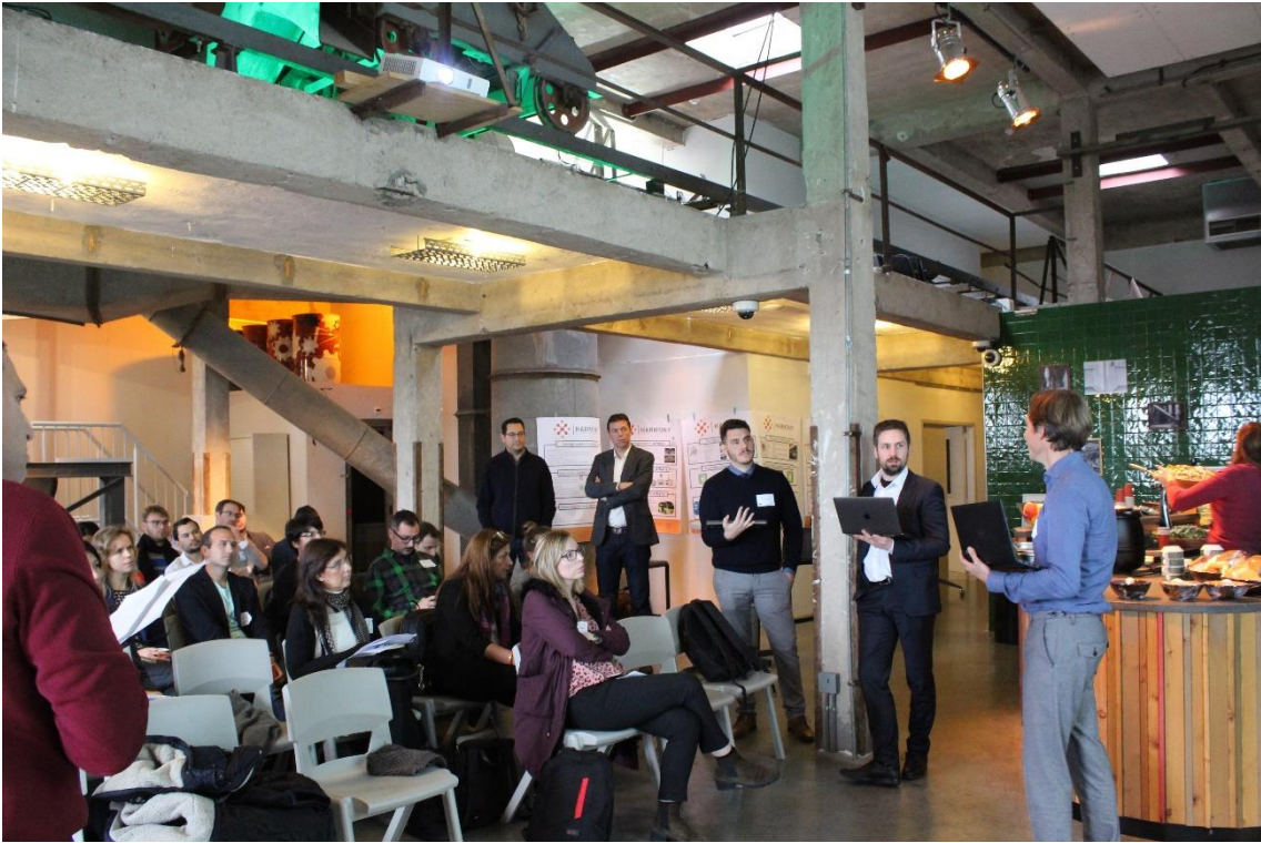
Presentation at Harmony first cross-metropolitan workshop 07/11/2019, Rotterdam, the Netherlands.