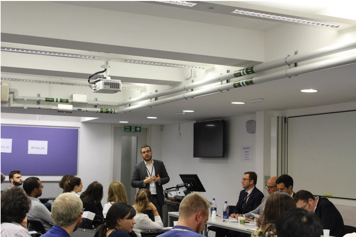
Panelists at the launch event, 07/06/2019, London, UK.