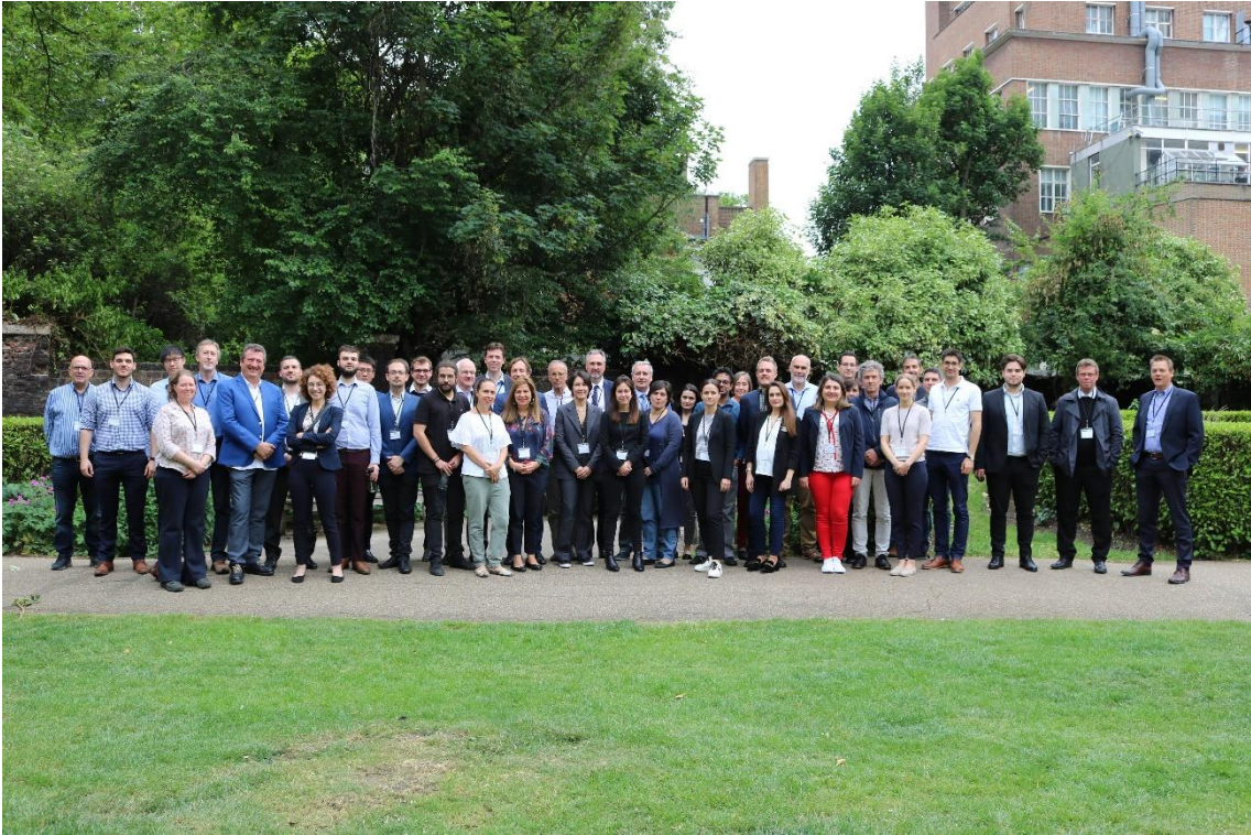
Project Consortium, 05/06/2019, London, UK.